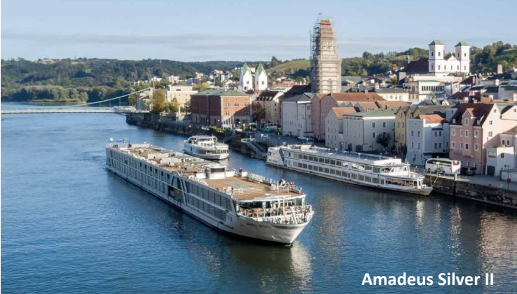
Amadeus Silver II