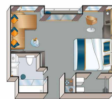
Suite Mozart Deck (284 sf)